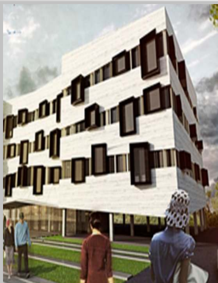
VSBL - FUSO OMR