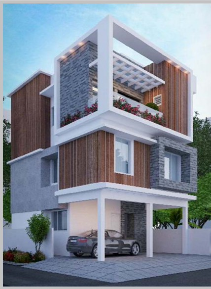
RP - CONTRACT WORK - KANDIGAI