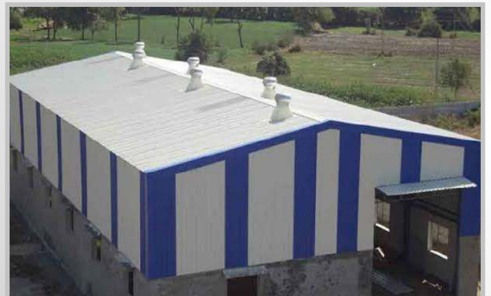
RP HOSUR - CONTRACT WORK - PRABAKAR PROJECT - ZUZUVADI - HOSUR