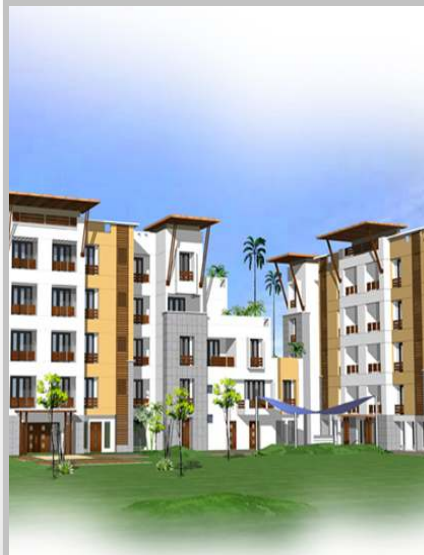
VSBL - RAIN TREE NUNGAMBAKKAM