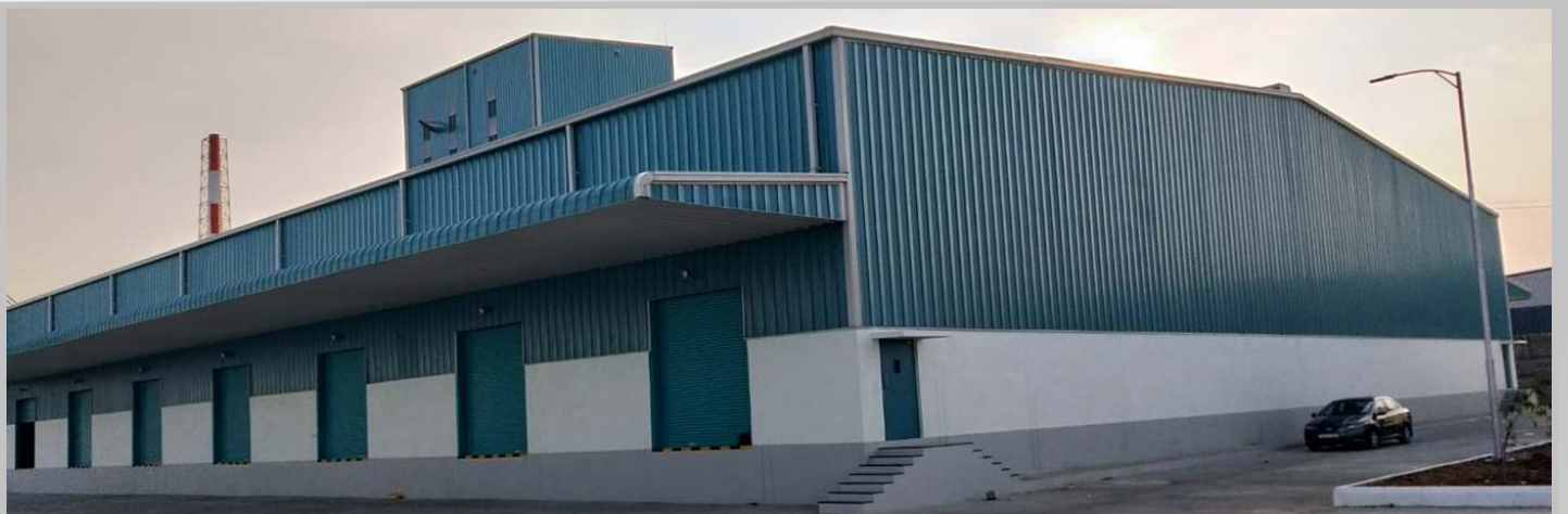
PN HOSUR - PMC WORK - NAKODA - KELAMANGALAM HOSUR