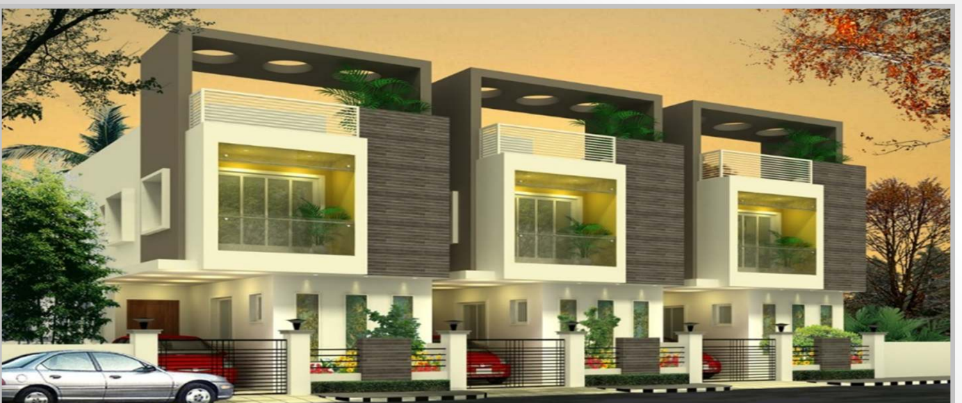
RP - PROMOTERS - KANDIGAI