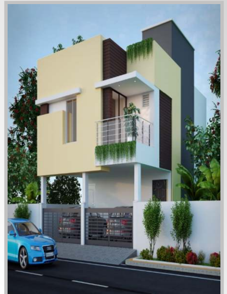
RP - CONTRACT WORK - KANDIGAI