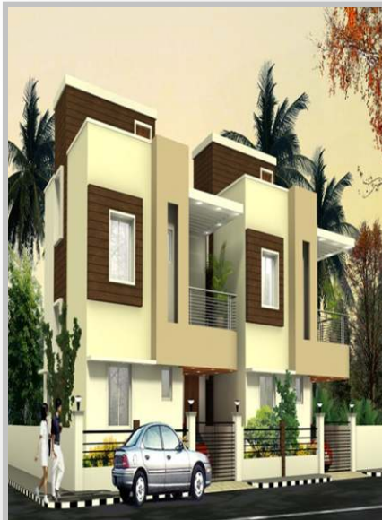
RP - CONTRACT WORK - KANDIGAI