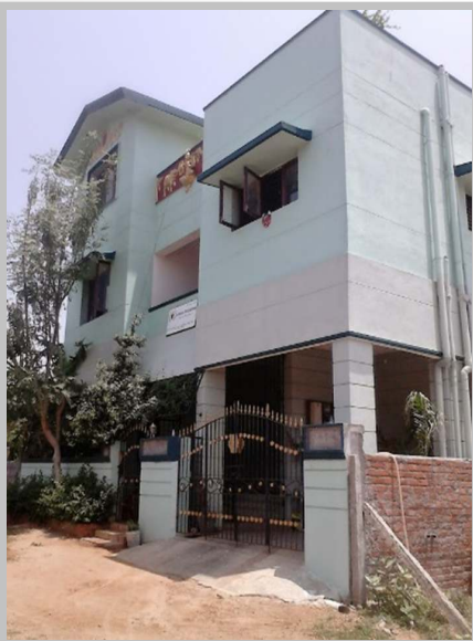
RP - CONTRACT WORK - KANDIGAI