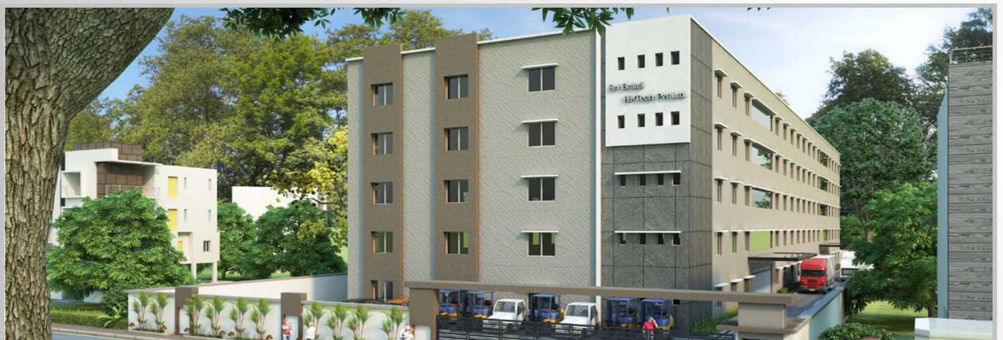
PN HOSUR - PMC WORK - KANDALA PRINTERS - HAROHALLI - KARNATAKA