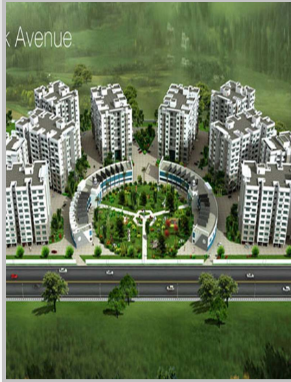
VSBL-PARK AVENUE KANDIGAI