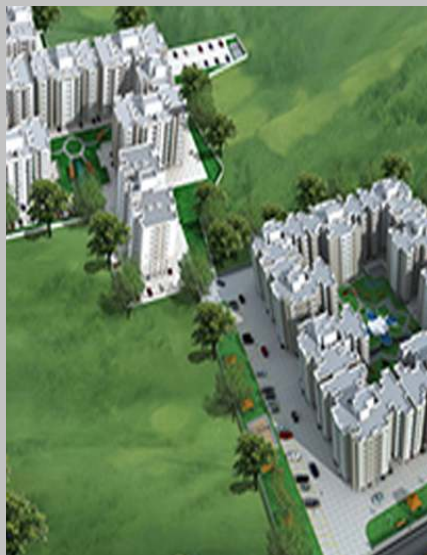
VSBL-LOTUS POND OMR