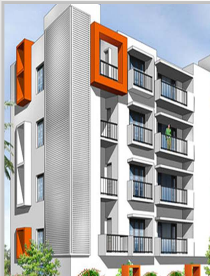
VSBL - FOUR SEASONS