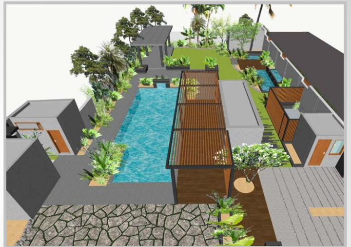
VILLA PROJECT BY VIJAY SHANTHI BUILDERS @ KOVALAM, CHENNAI