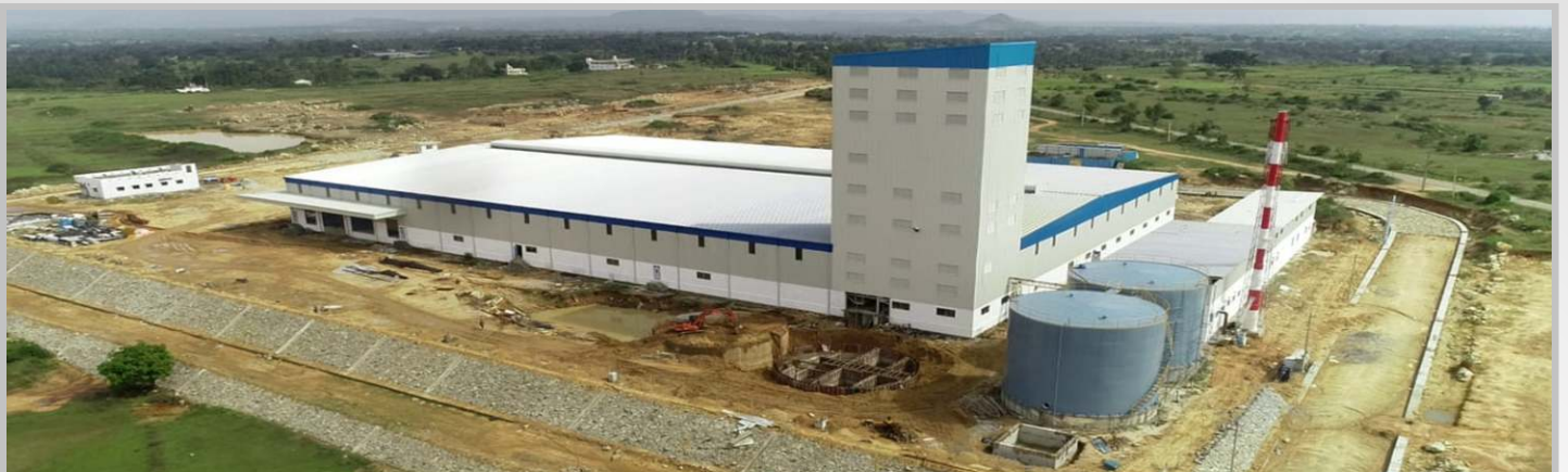
PN HOSUR - PMC WORK - FAVORICH - K.R DAMP NEAR - KARNATAKA