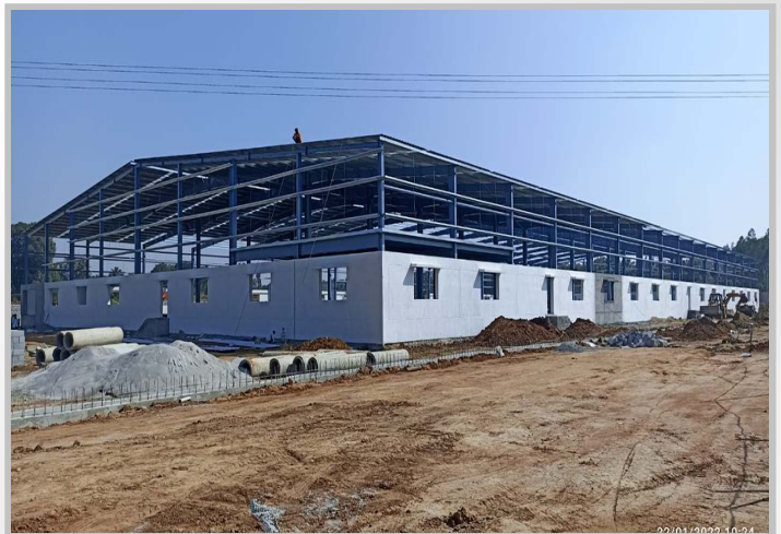
RP HOSUR - CONTRACT WORK - MERITOR AXLETECH PROJECT - SHOOLAGIRI