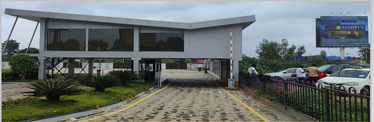
PN HOSUR - PMC WORK - RAJU MINERAVA PARKING - BANGALORE INTERNATIONAL AIRPORT NEAR - KARNATAKA