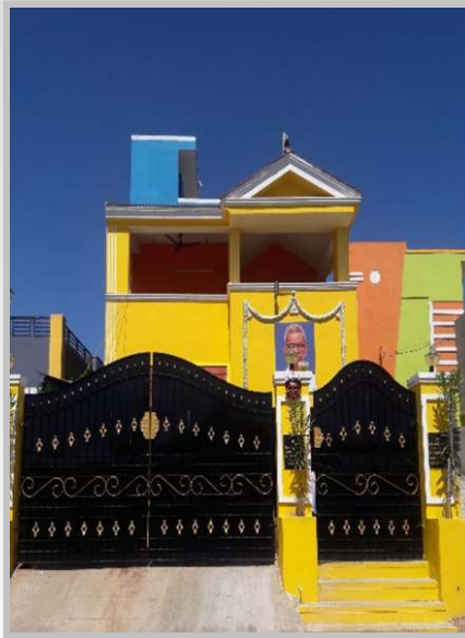
RP - CONTRACT WORK - KEERAPACKKAM