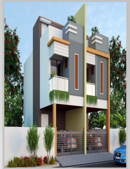
RP - CONTRACT WORK - TAMBARAM