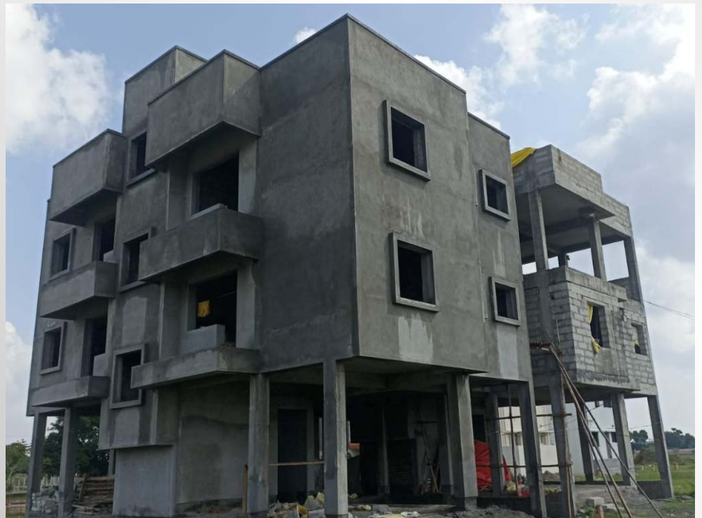
CREST APARTMENT BY VIJAY SHANTHI BUILDERS @ RATHINAMANGALAM, CHENNAI